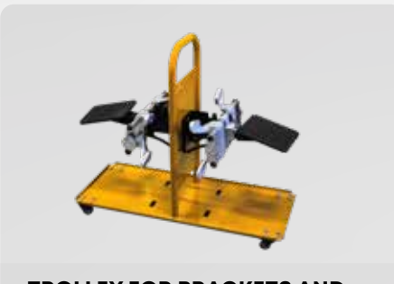
TROLLEY FOR BRACKETS AND TARGETS