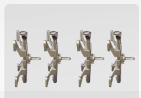
SELF-CENTRING 10-21" BRACKETS