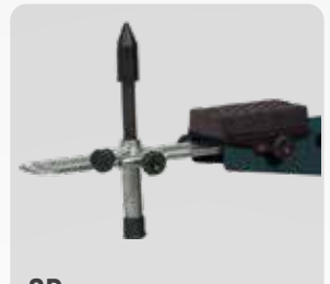
SR Wheel support kit

For other optional accessories, refer to separate catalogue.