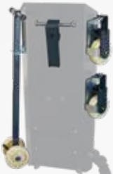
8-4110028 KIT ON CARRIAGE Consisting of wheels and manual lever