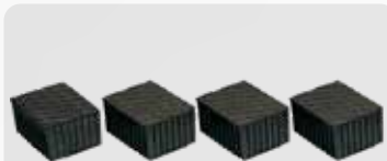
8-42300027 RUBBER BLOCKS Kit of 4 pcs H=80 mm

See separate catalogue for further accessories.